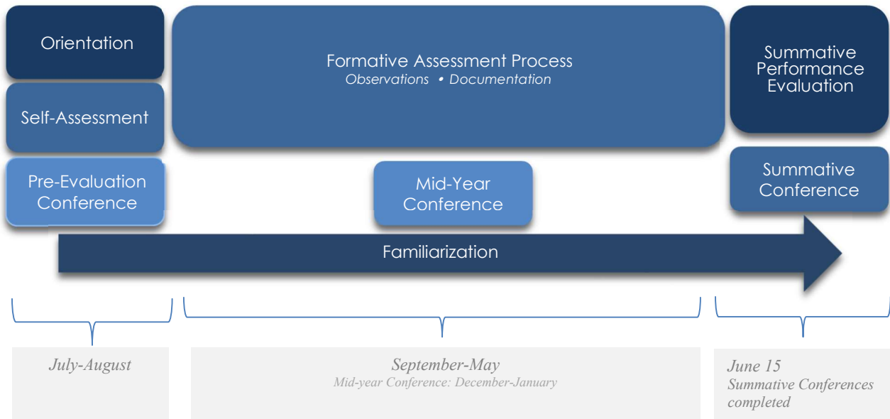
Figure 4: Teacher Assessment on Performance Standards Process Flow

The process by which LEAs shall implement the TAPS portion of the Teacher Keys Effectiveness System is depicted in Figure 4. This flow chart provides broad guidance for the TAPS process, but LEAs should consider developing internal timelines for completion of steps at the LEA and school level.