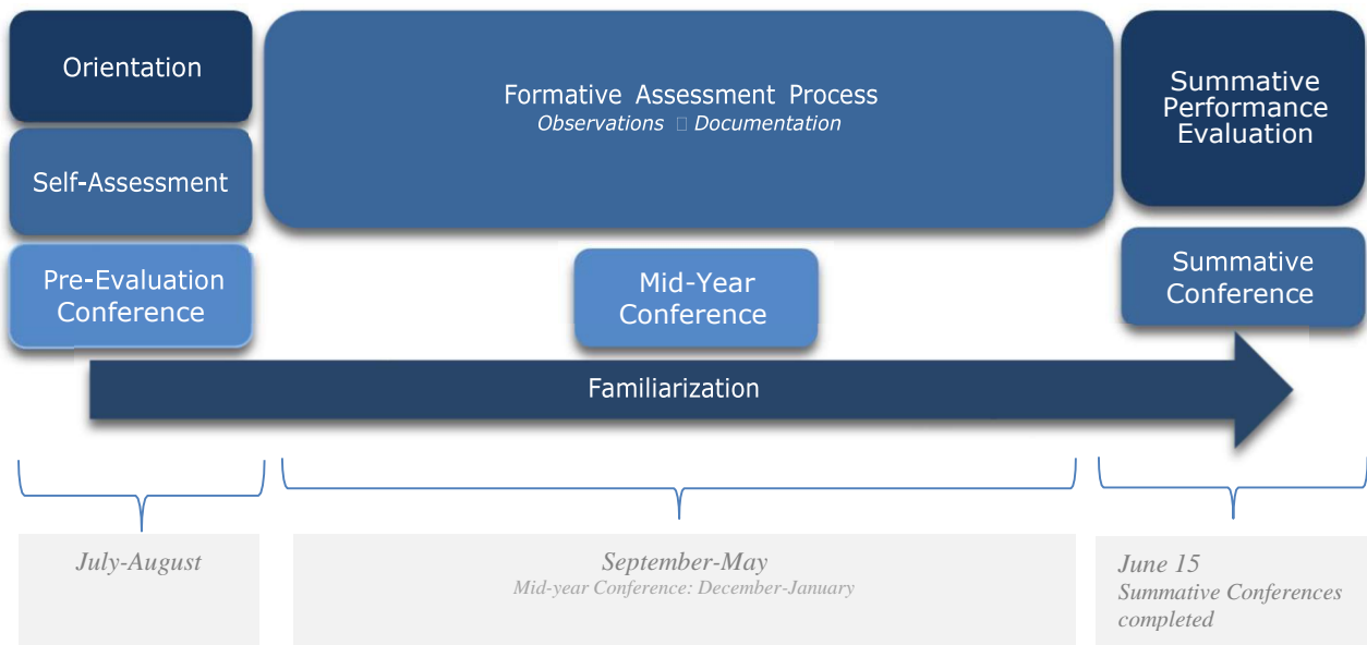
Figure 4: Teacher Assessment on Performance Standards Process Flow

The process by which LEAs shall implement the TAPS portion of the Teacher Keys Effectiveness System is depicted in Figure 4. This flow chart provides broad guidance for the TAPS process, but LEAs should consider developing internal timelines for completion of steps at the LEA and school level.