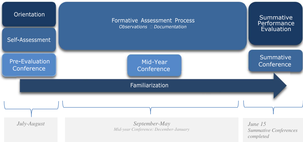
Figure 4: Teacher Assessment on Performance Standards Process Flow

The process by which LEAs shall implement the TAPS portion of the Teacher Keys Effectiveness System is depicted in Figure 4. This flow chart provides broad guidance for the TAPS process, but LEAs should consider developing internal timelines for completion of steps at the LEA and school level.