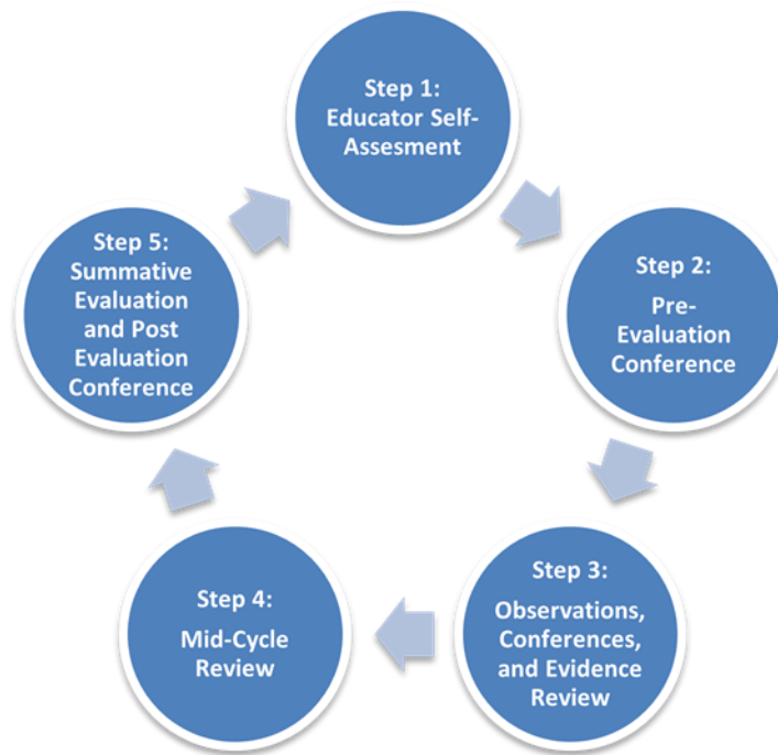
Figure 1: Evaluation Cycle

At the beginning of the school year, the educator receives a complete set of materials that includes the Teacher-Librarian Instructional Practice Standards and the Teacher-Librarian Professional Responsibilities Standards rubrics with Standards, Indicators, Performance Level, and evidence sources, as well as access to the current year NEPF Protocols outlining the evaluation process. The educator and evaluator meet to establish expectations and consider goals. They discuss the evaluation process together (including observations/visits, review of evidence, etc.) and review the NEPF Rubrics that describe the Standards and Indicators. The purpose of this review is to develop and deepen shared understanding of the Standards and Indicators in practice. The rubric review is also an opportunity to identify specific areas of focus for the upcoming school year.