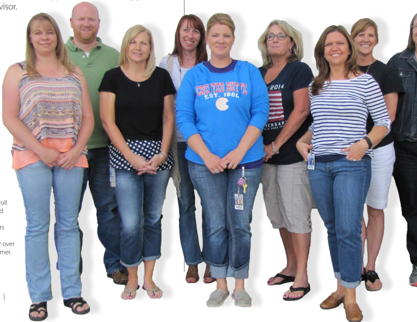
The payroll team and Kronos managers working together over the summer.

For the employees' convenience, we offer the option of having their paycheck automatically deposited to their bank account.