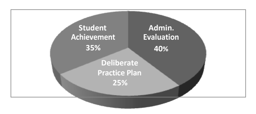
VSET's Multi-Metric Evaluation System

Administrative Evaluation (40%) + Deliberate Practice (25%) + Student Achievement (35%) = Final Summative Rating (100%)