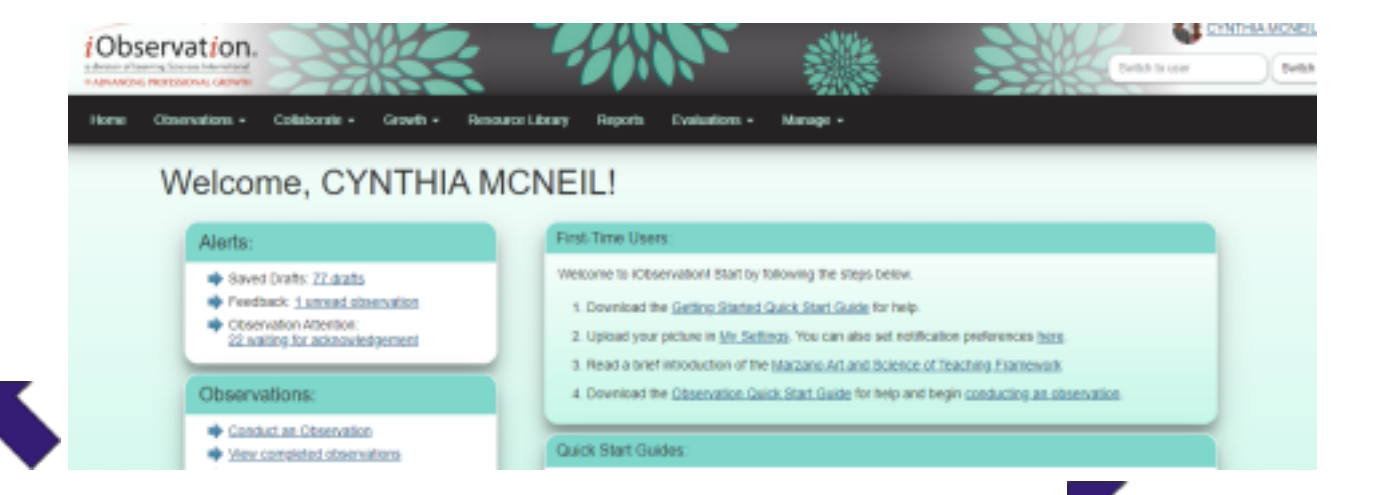
Step 1: Hover over "Evaluations" and click "Evaluate".

Midpoint Evaluations are to be completed at the midpoint of the observation/evaluation cycle. Think of the midpoint evaluation as a progress report for the teacher.