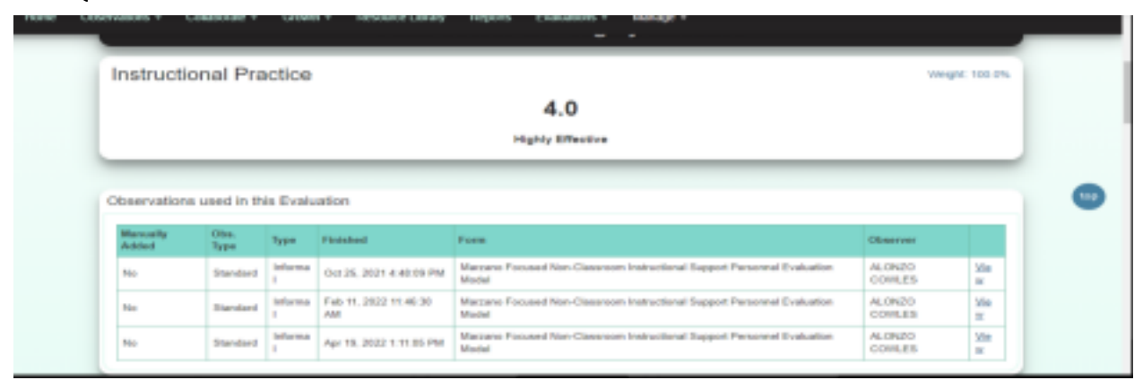
Step 4: Click sign and finish